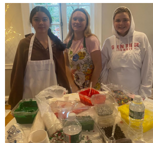
Girls' Club volunteers at one of the cookie decorating stations.