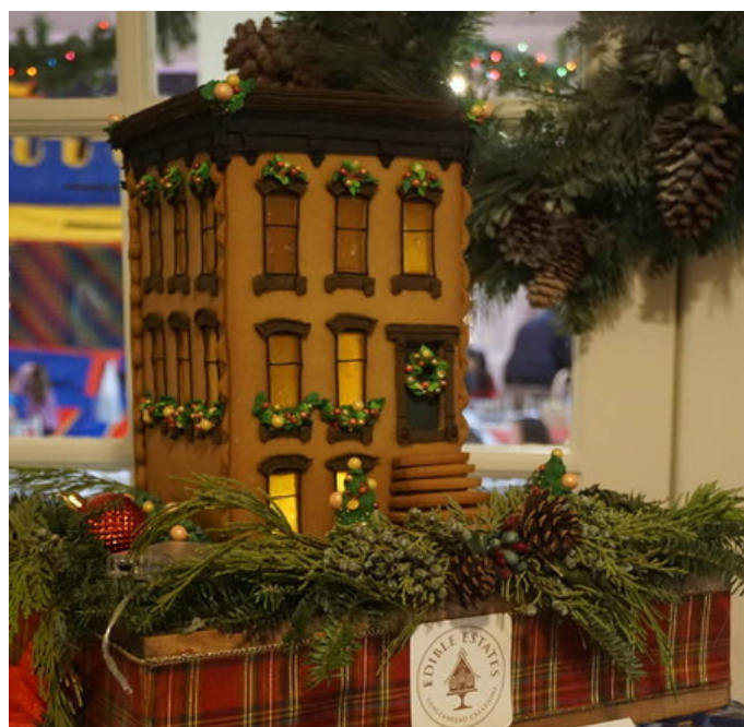
This gorgeous gingerbread house was made by Edible Estates and generously donated to the Club for the Winter Wonderland held last weekend. Turn to page 4 for more Family Department news.