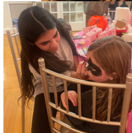
Girls' Club members and young attendees at the Scare for the Cure event.