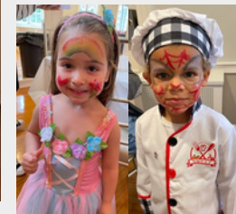
Face painting fun.