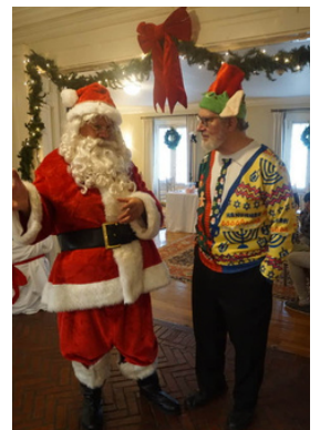
Santa chatting with one of his elves.