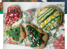
Some colorfully decorated cookies.