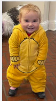
The cutest Pikachu you've ever seen!