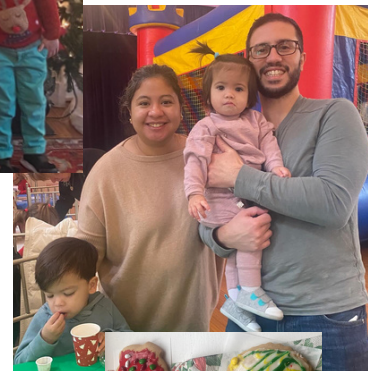
Just some of the many families that had a wonderful time at Winter Wonderland.