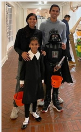
Apparently Wednesday Addams and Darth Vader are related. #WhoKnew