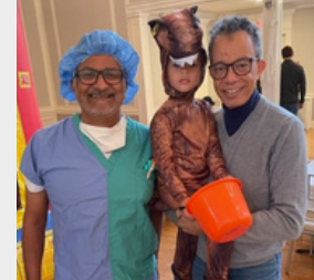
Doctors and dinosaurs.